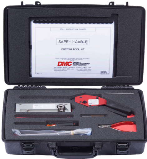
Actual Kit may vary from example shown.

Safe-T-Cable® Tool and Parts Kits are a travel-ready system whereby the user has Tools, Verification Equipment, Accessories, a supply of Cable/Ferrules, and the Instructions all in one package.