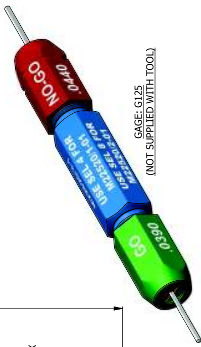
GAGE: G125 (NOT SUPPLIED WITH TOOL)

UNCONTROLLED DOCUMENT WILL NOT BE UPDATED DIMENSIONS IN INCHES - UNLESS OTHERWISE SPECIFIED