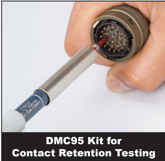
DMC95 Kit for Contact Retention Testing

The quality assurance test most often overlooked is contact retention (the proper seating of contacts within the connector). This important test can now be performed simply and in a matter of seconds with the DMC95 Retention Test Tool Kit .