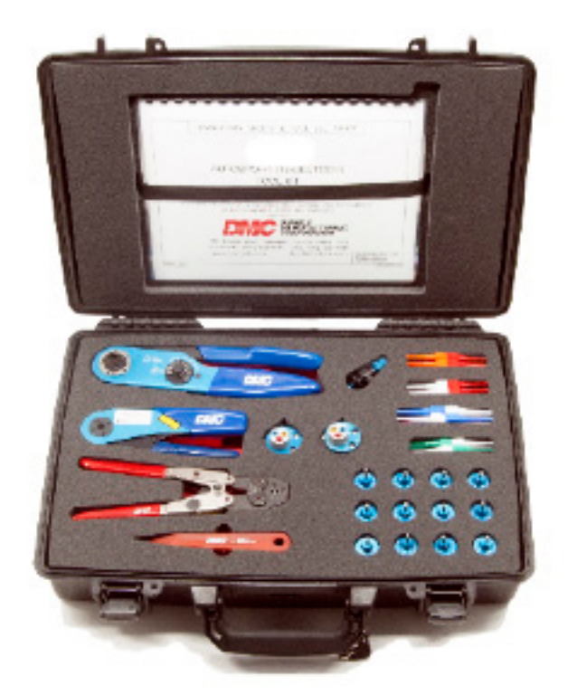
Actual Kit may vary from example shown.

ALL IN ONE . Since these tools, together with their operating instructions, are contained in a single kit, the connector repair can be made in the shortest time possible, thus permitting a rapid return of your aircraft to service. Tool kit supplied in an environmentally sealed Polypropylene Copolymer cases and includes: Name Plate. Foam Pads/Inserts, Contents Charts, Instruction Charts, and Tool Selection Charts.