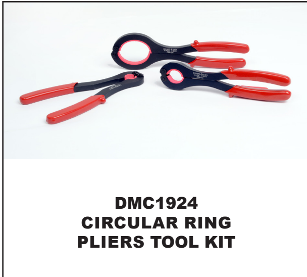
DMC1924 CIRCULAR RING PLIERS TOOL KIT

The DMC1924 kit supplies your staff with the tools and accessories necessary for circular connectors and backshell components sizes 7 through 28.