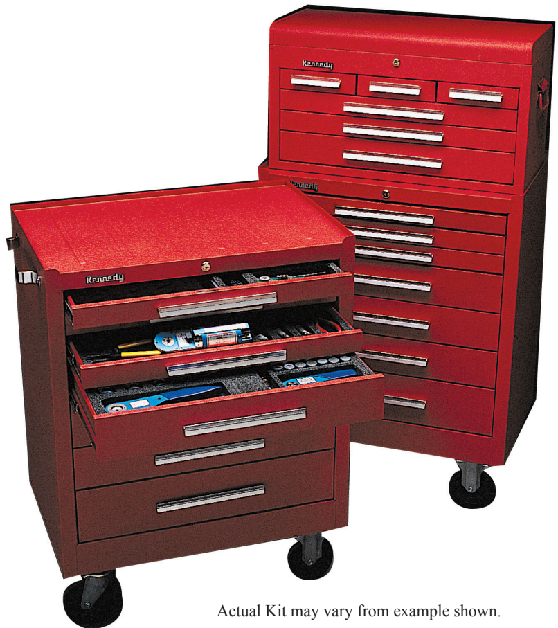
Actual Kit may vary from example shown.

ALL IN ONE. Since all of these tools, together with their operating instructions, are contained in a single kit, the connector repair can be made in the shortest time possible, thus permitting a rapid return of your Boeing C-17 to service.