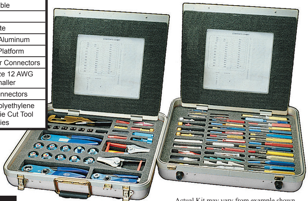
Actual Kit may vary from example shown.