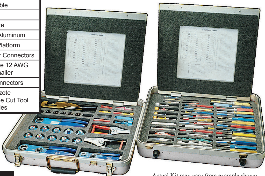
Actual Kit may vary from example shown.