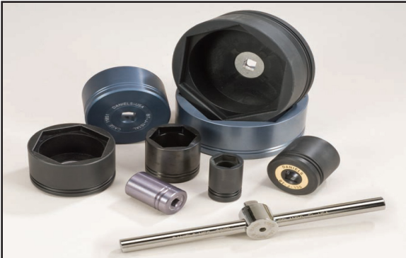
DMC1358 COMPOSITE JAM NUT TOOL KIT

The correct application of torque is essential to most connector applications where Jam Nut receptacle connectors are used. The sealing components (usually an "O" ring) must be compressed, but not to the point of damage. Another important consideration when tightening Jam Nuts is the thread strength, especially in the various types of aluminum and composite connectors.