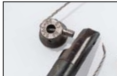
Step 4 - Crimp & Cut

The ferrule is firmly crimped and the cable is cut flush with the end of the ferrule.