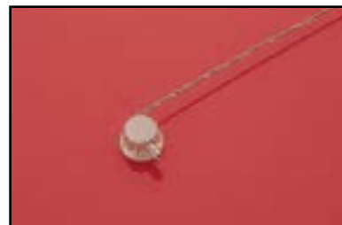
Step 4 - Crimp & Cut

The ferrule is firmly crimped and the cable is cut flush with the end of the ferrule.