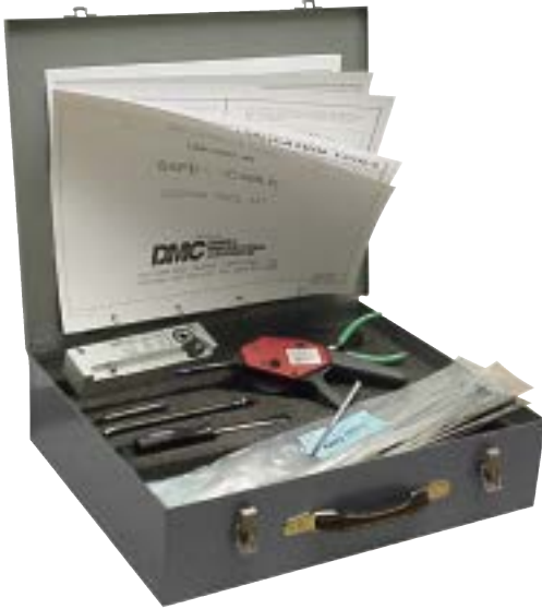
Actual Kit may vary from example shown.

Safe-T-Cable® Tool and Parts Kits are a travel-ready system whereby the user has Tools, Verification Equipment, Accessories, a supply of Cable/Ferrules, and the Instructions all in one package.