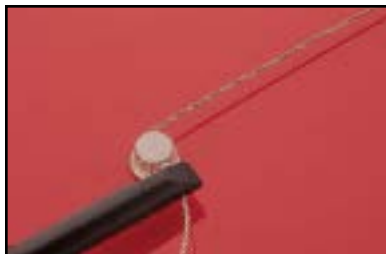
Step 3 Tension

Simply thread the cable through the ferrule and the tool nose.