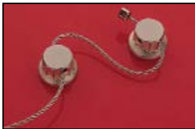
Step 1 - Thread

A cable assembly is threaded through the fasteners in a direction that exerts a positive pull on the fastener when tension is applied.