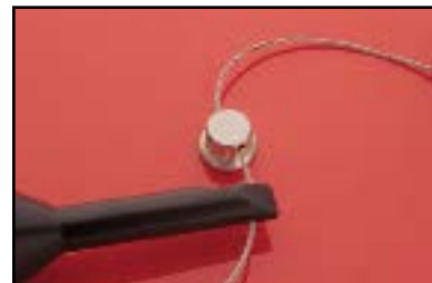
Step 2 - Insert

A cable assembly is threaded through the fasteners in a direction that exerts a positive pull on the fastener when tension is applied.