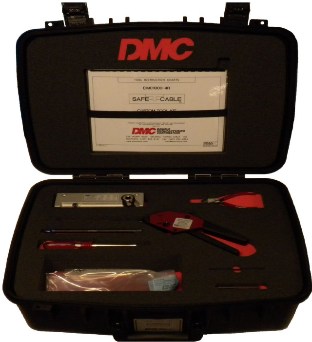
Actual Kit may vary from example shown.