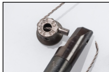
Step 4 - Crimp & Cut

The ferrule is firmly crimped and the cable is cut flush with the end of the ferrule.