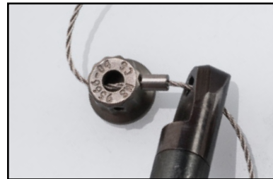
Step 2 - Insert

A cable assembly is threaded through the fasteners in a direction that exerts a positive pull on the fastener when tension is applied.