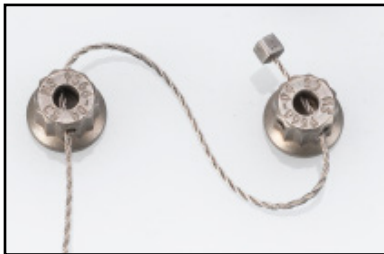
Step 1 - Thread

A cable assembly is threaded through the fasteners in a direction that exerts a positive pull on the fastener when tension is applied.