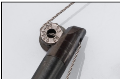
Step 3 Tension

Simply thread the cable through the ferrule and the tool nose.